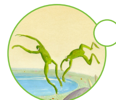
H These aren't ducks.