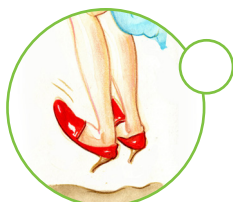
F These are hands.