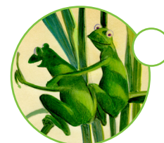
D These are frogs.