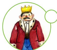
C This is a princess.