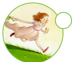
E This isn't a girl.