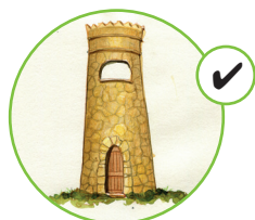
A This is a tower