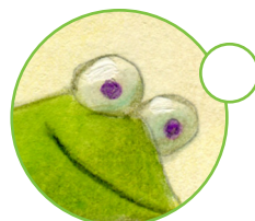
G These are eyes.