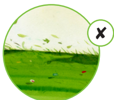
B This is a pond.