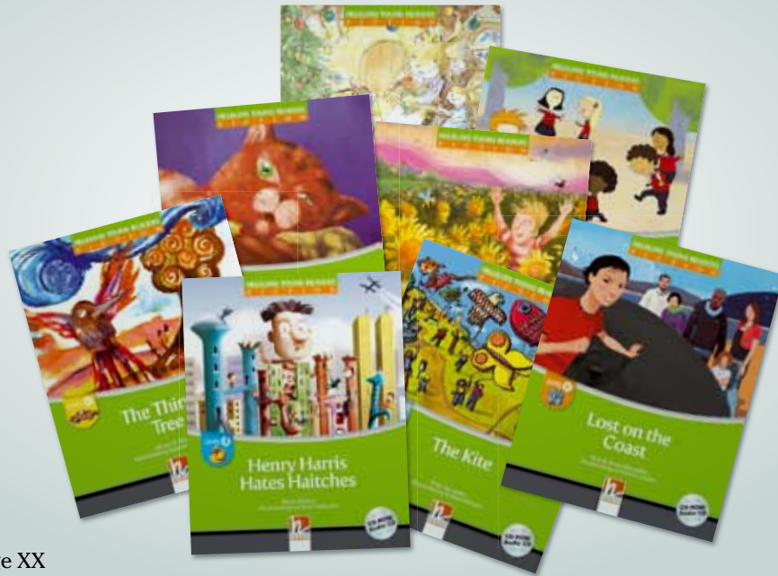
Disal Editora, 2011 See PromoMag Page XX

Disal Helbling Young Readers is a beautiful series of graded readers that tell the most adorable and involving stories. The first thing that stands out is the quality of the full-colour illustrations and the artwork. Different illustrators have depicted different stories; although all equally brilliantly, each book still manages to display its very own style, which brings a fascinating variety of colours and shapes to the tales. Particularly noteworthy is the very attractive and original artwork in Henry Harris Hates Hatches , a book that jumped into my hands because I was dying to check what visual effect each page would offer me.